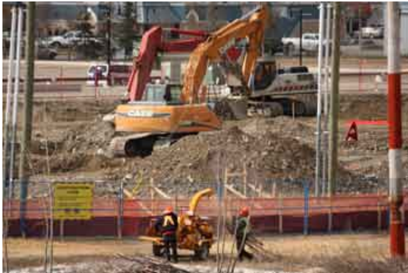
After lots of hard planning, work began on the Cultural Centre site at the foot of Black Street in the spring of 2010.