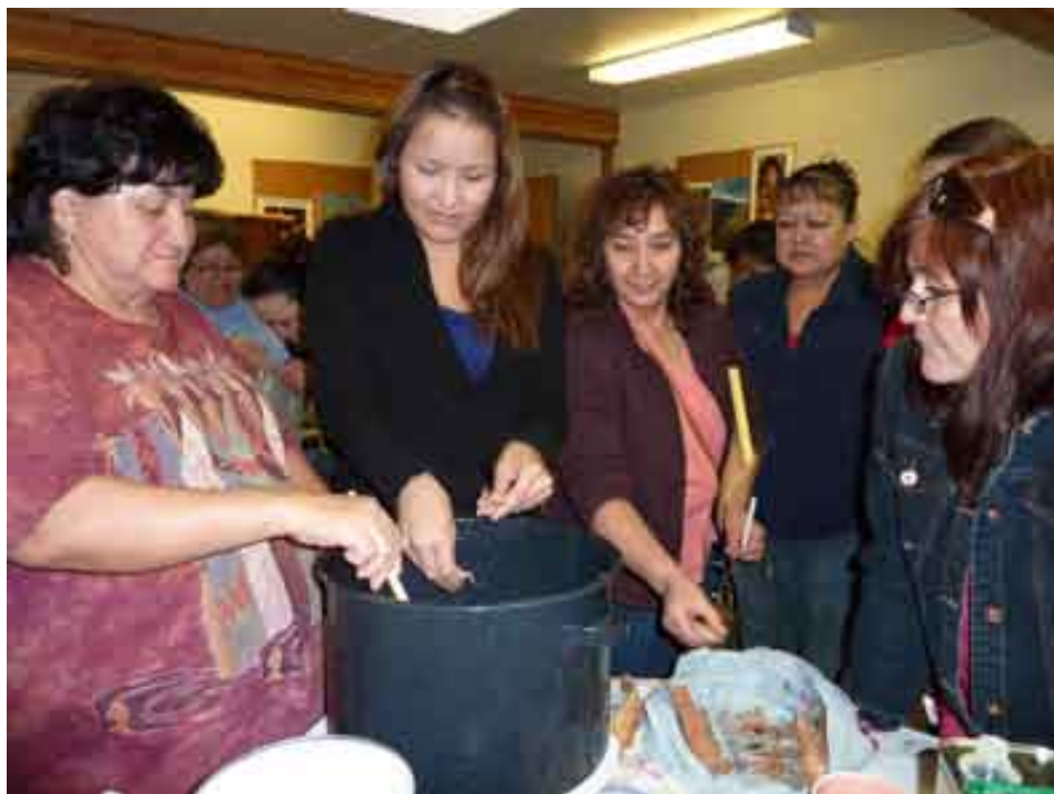
Community wellness offers a variety of workshops to help people learn about their culture and healthy living. Women at this traditional medicine workshop learned how to make a salve using spruce pitch.

A computerized database for Health was completed and implemented. The database tracks who is accessing our services and how often. We are also able to tell how many clients from the