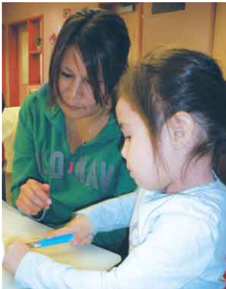
Making applesauce at the Dusk'a Learning Centre.

With the continued commitment to exercising self-government interests in K-12 education, Education will participate actively in planning for a KDFN Kindergarten. The department sees that while the new Dusk'a Head Start Family Learning Centre is the foundation for young children going on to Kindergarten, it is also the foundation for developing a KDFN Kindergarten in terms of programming, the integration of language and culture, community and family involvement, and the development of community capacity.